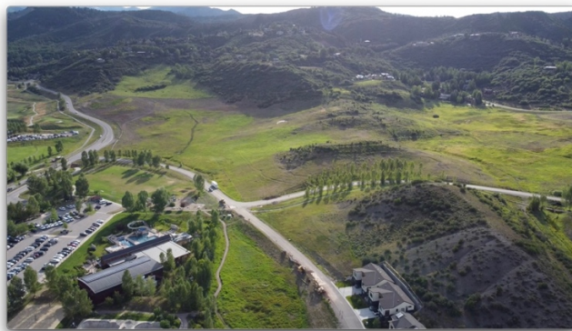
Horse Ranch potential parking.

5 – Close to the Recreation Center there is a flat area within the Horse Ranch pasture. The Horse Ranch HOA owns this flat portion of the meadow. Municipalities often purchase land from different land owners for the benefit of the community. RFVHC suggests that TOSV acquire this land for the greater good. This level pasture area could be a place for additional equestrian parking for trucks and trailers and additional winter skier parking.