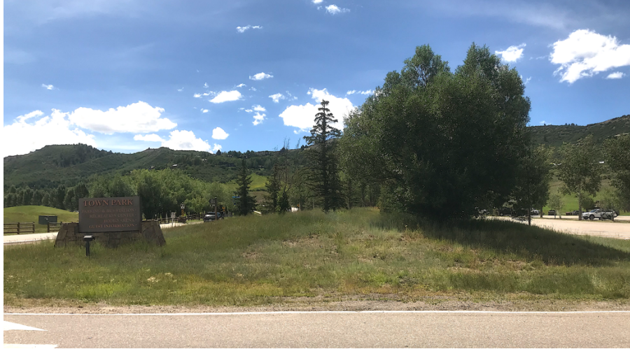
Existing Town Park unattractive, sparsely vegetated, wide berm, between Brush Creek Road and the Recreation Center parking

3 – Remove the unattractive, sparsely vegetated, wide berm, which is approximately 1000+ feet in width, between Brush Creek Road and the Recreation Center parking area. Use some of the material to build a more narrow, beautifully planted, buffer berm along brush Creek Road, next to a newly leveled and graded parking area. The new parking area has the potential for parking 10 trucks and trailers on rodeo nights and more than 40 car spaces year-round. This new parking lot would be contiguous to the existing Recreation Center parking area.