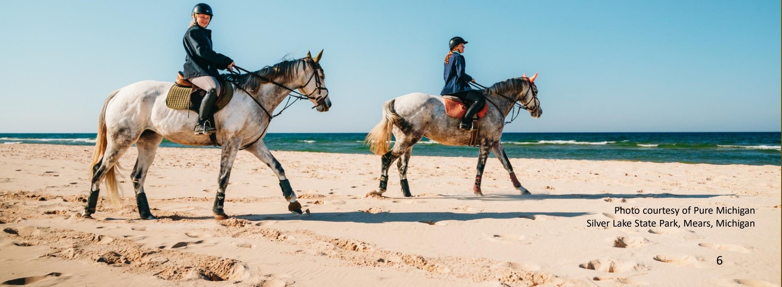
Photo courtesy of Pure Michigan Silver Lake State Park, Mears, Michigan

Horses improve balance, flexibility, muscle strengthening, stamina, and more for people.