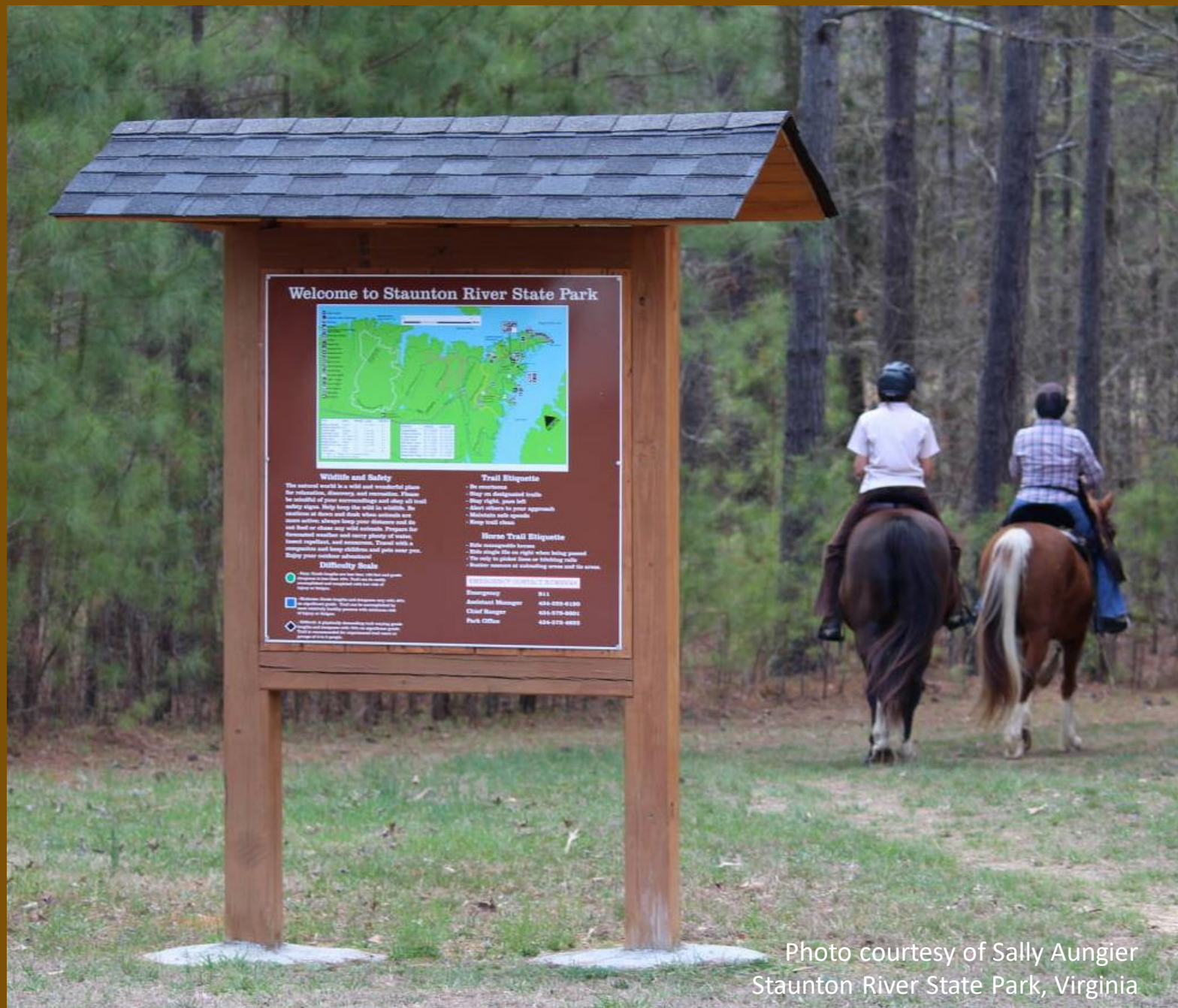
Staunton River State Park, Virginia

Horses provided our first autonomous modes of transportation. They have excellent situational awareness and self-preservation skills. They will take care of both themselves and their rider.