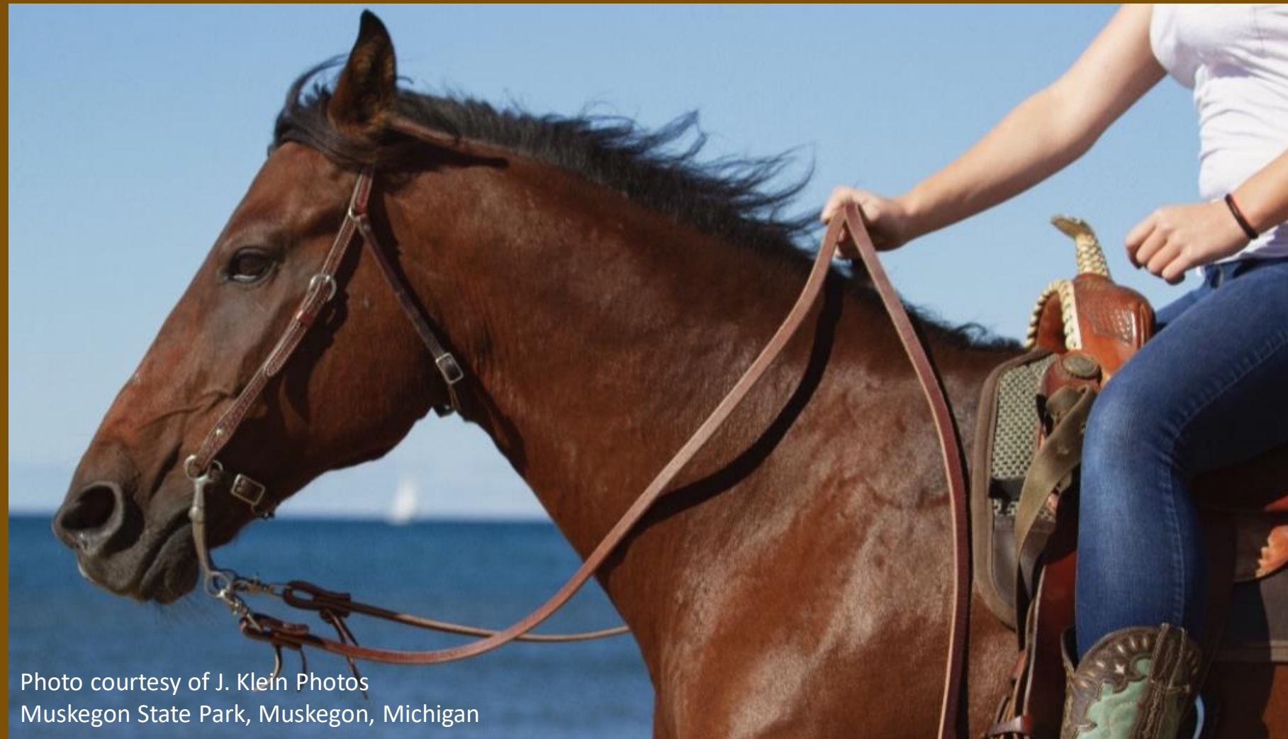
Photo courtesy of J. Klein Photos Muskegon State Park, Muskegon, Michigan

Horses are exceptional search and rescue partners.