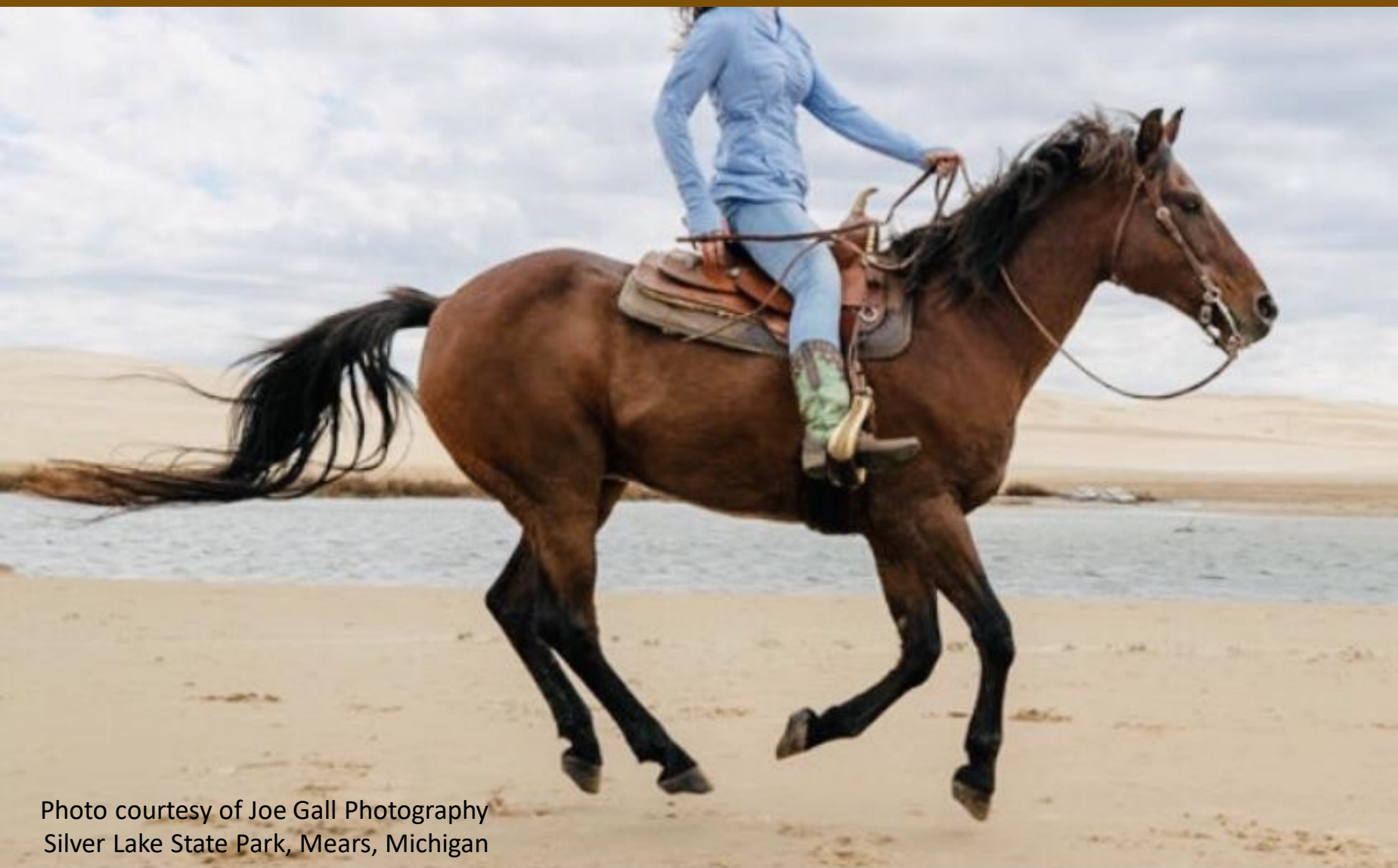
Silver Lake State Park, Mears, Michigan

Each of their gaits (walk, trot, and run) simulate our gaits, providing people essential industry, therapy, and transportation partners.