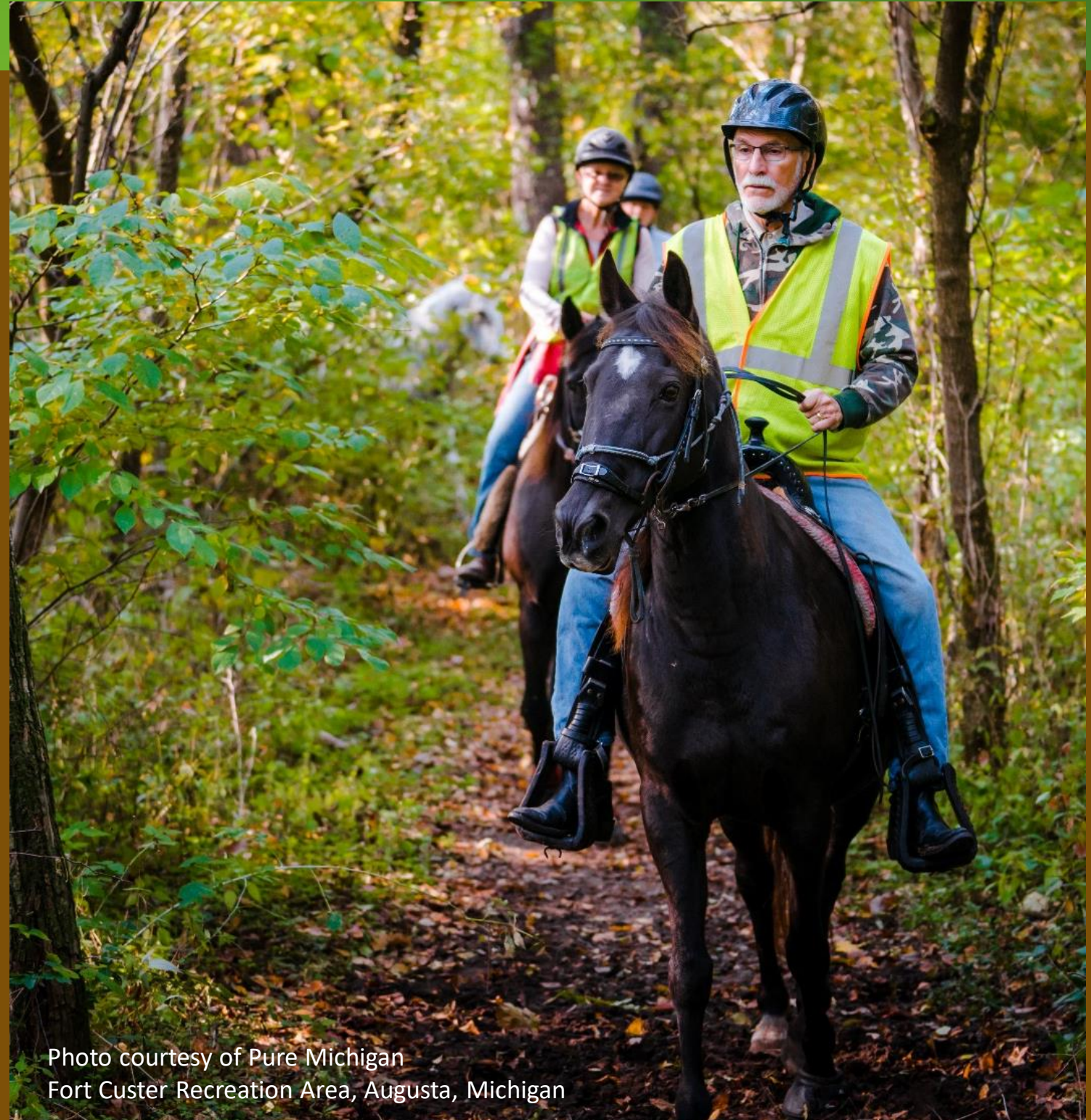
Photo courtesy of Pure Michigan Fort Custer Recreation Area, Augusta, Michigan

Always ask horse owners before approaching their horses. Please approach horses at their sides, not directly at their faces or behind them.