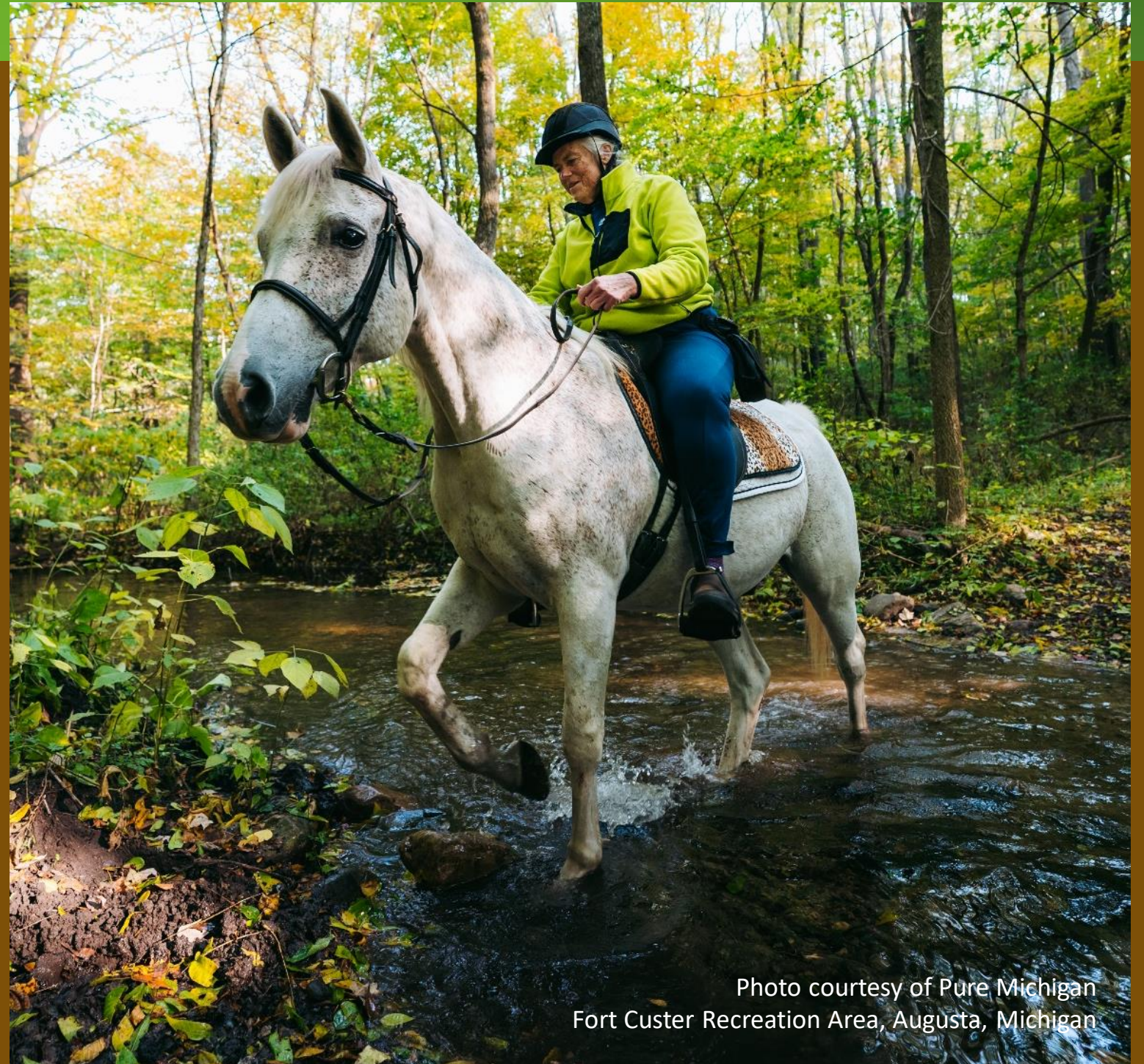
Photo courtesy of Pure Michigan Fort Custer Recreation Area, Augusta, Michigan

Horses only have one-dimensional vision, so they have difficulty with depth perception, such as how far away a bike is or how deep the water is at water crossings.