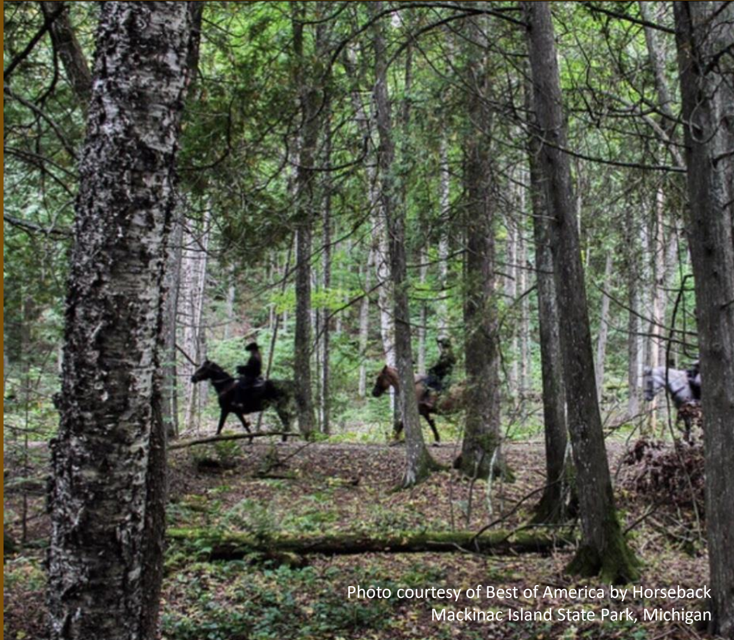
Mackinac Island State Park, Michigan

Horses have a four-beat hoof pattern and prey scent, so even with a rider on their back horses disturb other wildlife less than all other user groups, including hikers.