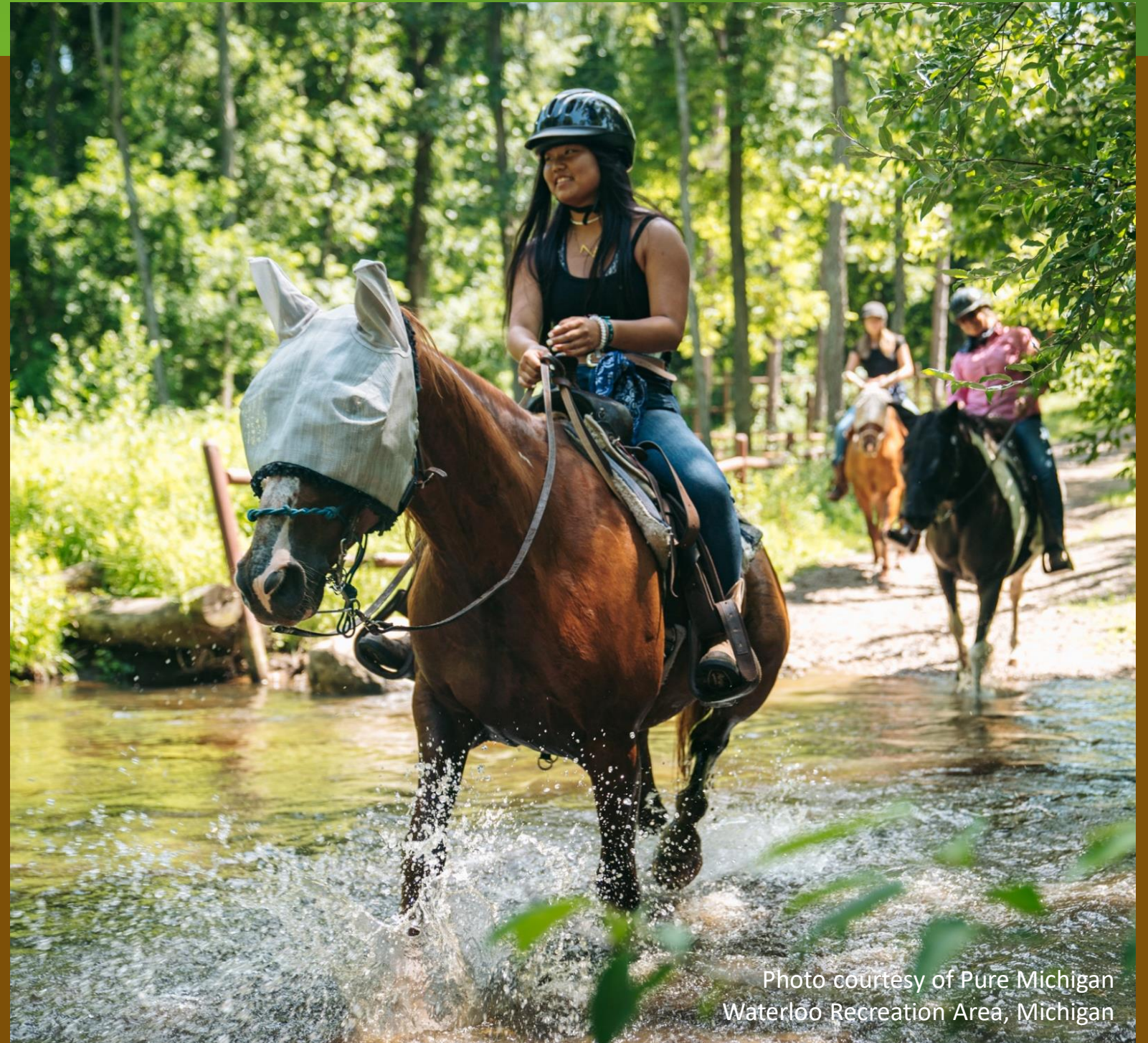
Waterloo Recreation Area, Michigan

People with horses often camp and travel in groups on the trails to keep their horses calm and comfortable.