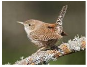
"We are the voice for our wildlife."

In November 2019, we learned that Pitkin County BOCC & Pitkin Road and Bridge is closing Prince Creek Road with gates for winter access to vehicles, preventing easy motorized human access into the 9,100 acres of "critical winter wildlife range" on "The Crown." Prince Creek Road gates will be closed Dec 1st through April 15th, protecting one of the most critical winter wildlife ranges in the Roaring Fork Valley. In 2017, the RFVHC wrote a letter requesting this closure for the benefit of the wildlife. We collected letters of support from every neighbor, rancher, and water right holder along Prince Creek Road. Thank you Pitkin County for protecting our wildlife and their critical winter habitat. Bravo!