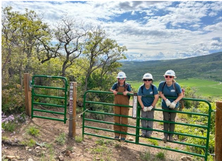
Standing for photography at the entrance gates from the Crown Jewel Horse Trail to the Glassier Equestrian and Hiking Trail