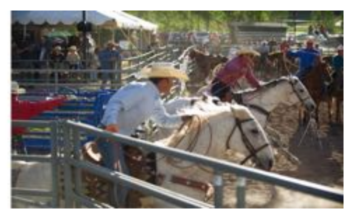
Asphalt and horses don't mix. A compromise will insure success for the rodeo and equestrian / hiker trail users. The RFVHC would like to become involved in the design for this proposed parking lot construction with a different composition, which is less expensive than asphalt and safer for all horses.

Here is the winter and spring 2021-22 RFVHC Survey about RFV Trails for Equestrians and Hikers: