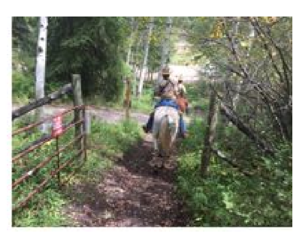
Headed back to the trail head