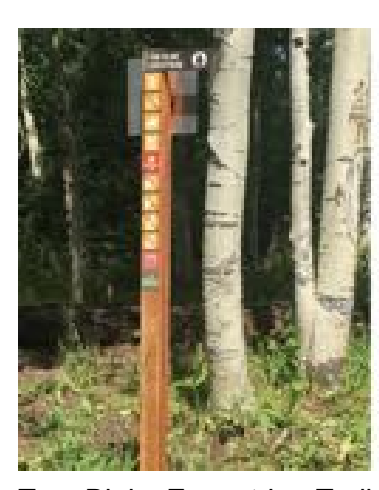
Tom Blake Equestrian Trail