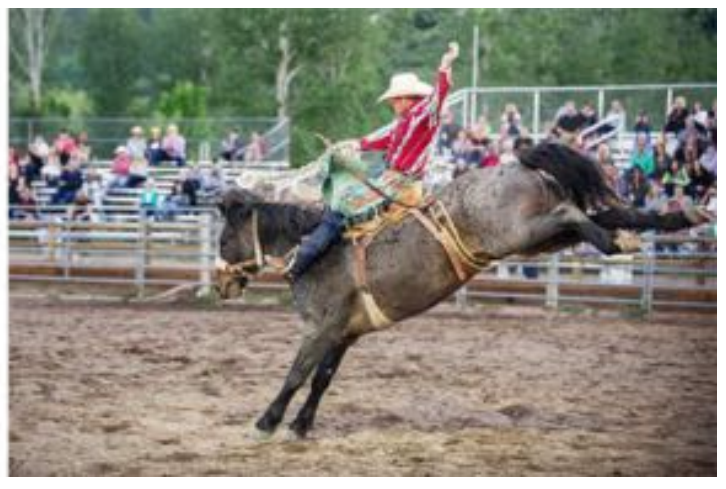
The Snowmass Rodeo is the oldest rodeo in Colorado. Throughout the summer, this historic western pageant thrills the crowds . Please support our Western Heritage tradition, still very much alive, every Wednesday night at the Snowmass Rodeo.