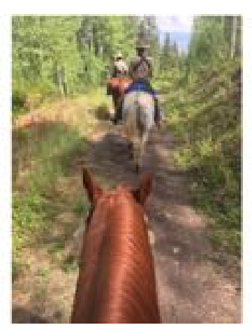
Enjoyable ride through the aspen trees