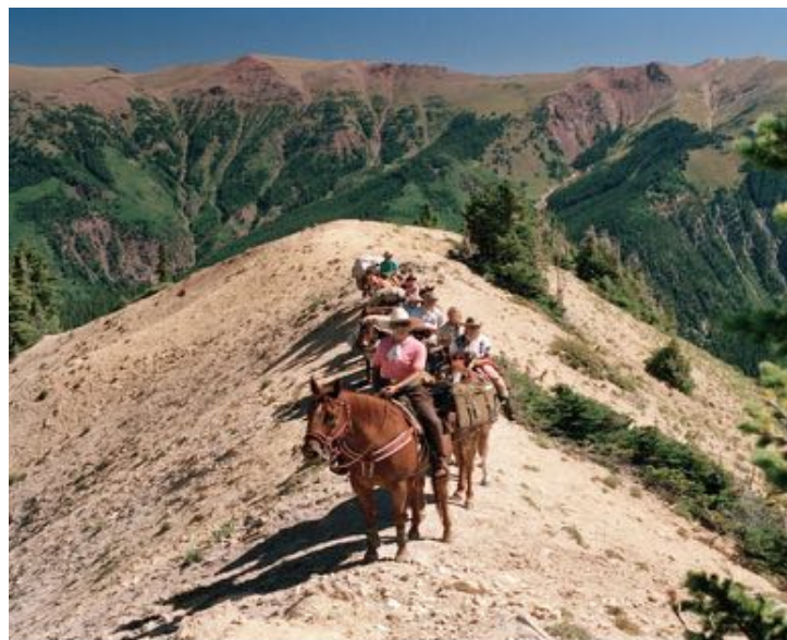
Snowmass – Maroon Wilderness offers spectacular trail riding

LEGEND: Survey Monkey responses are written in black RFVHC Comments and Solutions are written in red italics