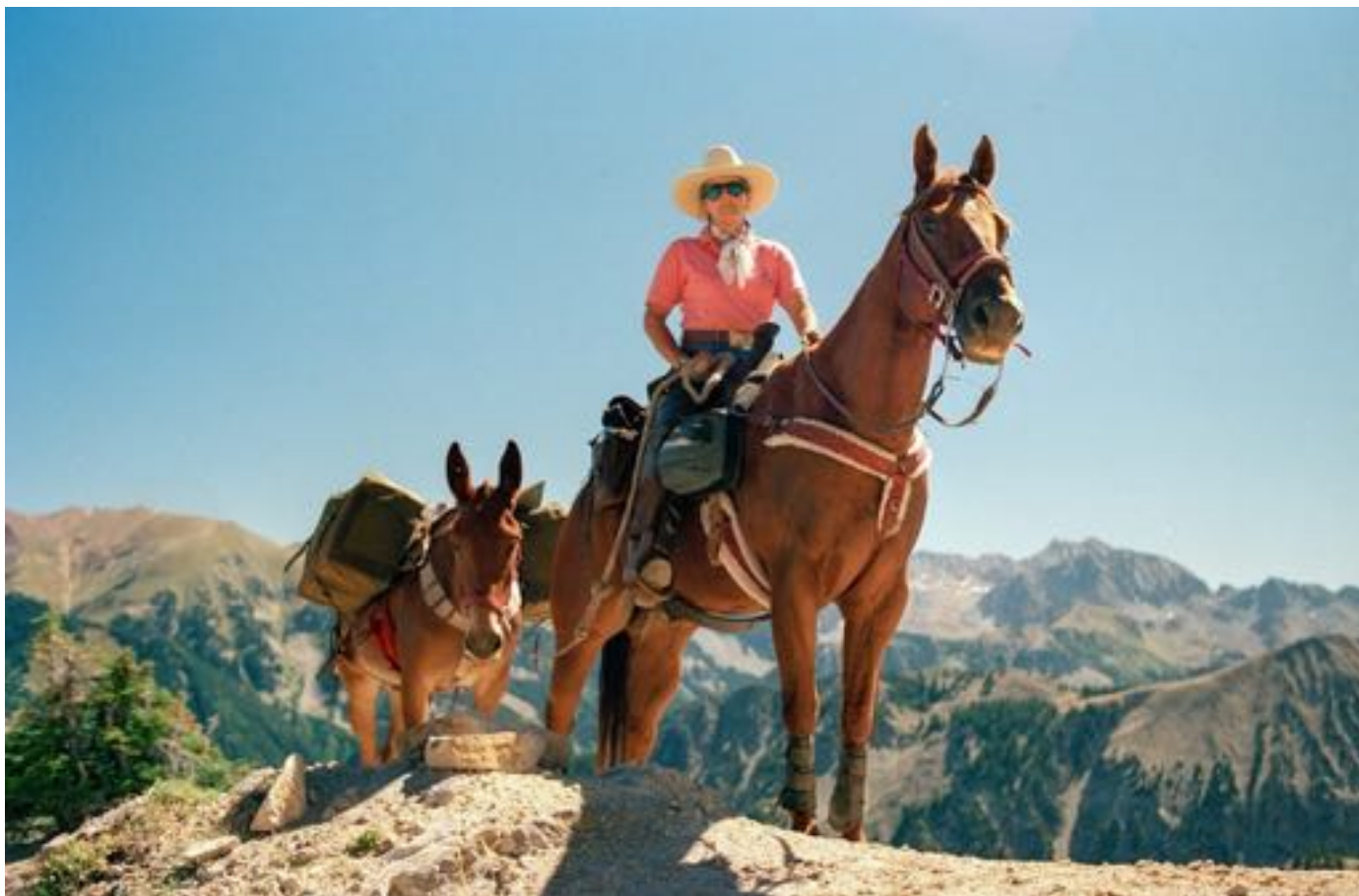
On Top Of The World – Just below East Creek Pass – Capitol Peak in the background