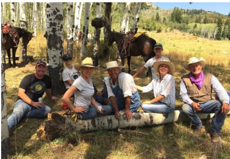
Coal Basin lunch ride with friends

Directions: Coal Basin & Coal Creek Road (FSR #307) (multi-users) Coal Basin is accessed from Highway 133, turn right at the Redstone Coke Ovens. To get to the trailhead from Redstone, travel 4 miles up Coal Creek Road (FSR #307) to a White River National Forest Service parking area and road closure. Did you know the old mine road is an up and back ride from the top of Coal Basin Road? The trail takes you through the old Mid Continent coal mining area. It's a steady climb on many reclaimed mining roads, so the platform is very wide and good for beginners, though grown-in and then mostly single track. From the single tracks there are meadows that you can explore. At around six miles, the trail ends and you return the way you came up. Avalanche Outfitters offer trail rides from May through October. Contact them for information or to book a ride at 970.963.1144