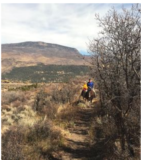
Nancy's Path can be accessed by the Glassier Equestrian Trail

RFVHC COMMENT. Nancy's Path is a forever equestrian trail and has received some maintenance since its development. The trail is lightly used due to its rough footing, steep grades and water erosion areas. As part of PITCO Open Space and Trails this trail should receive more repairs. It does offer an experienced horse and rider a loop ride via the Glassier Equestrian or the Divide Parking "Crown Jewel Trail" on the Crown. The nature of a trail in a ravine does not lend it to becoming an easy trail with soft footing. This Trail should not be traveled in bad weather. The RFVHC and the Mid Valley Trails Committee may be able to use grant funding for improvements.