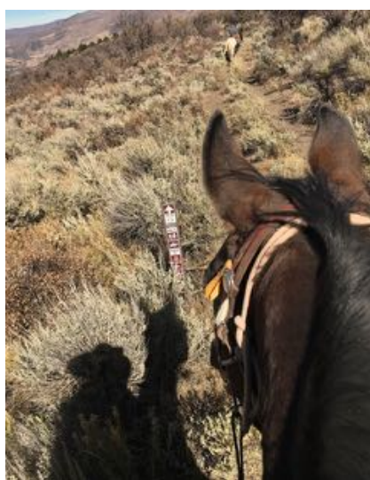
Nancy's Path cut-off from the Glassier Equestrian Trail