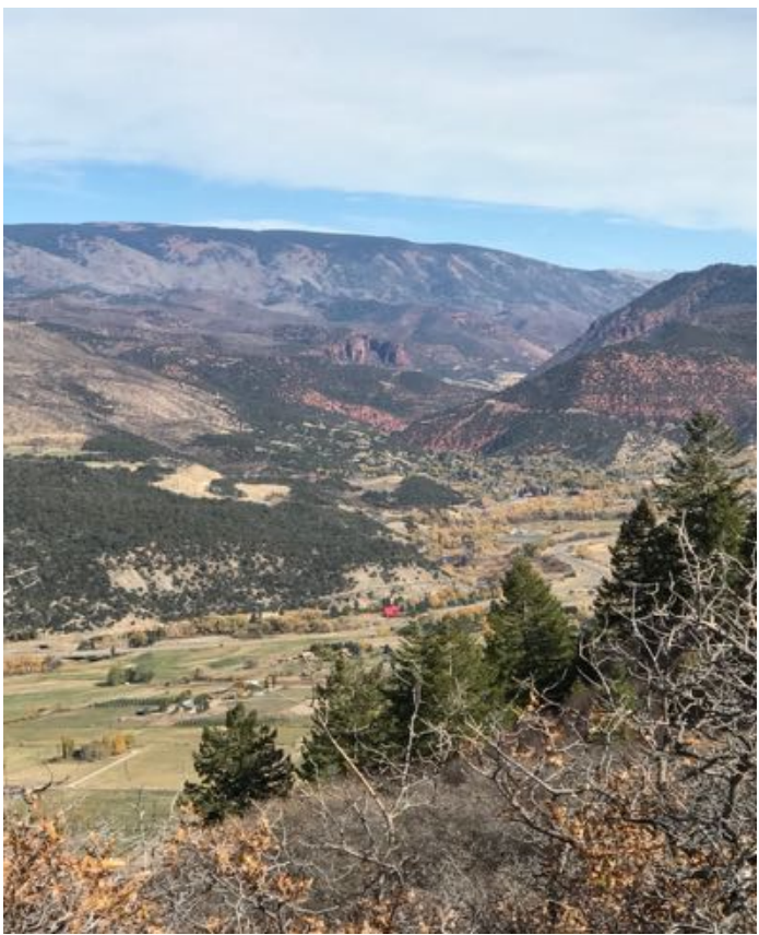
View of the Roaring Fork Valley - Basalt Mountain and Seven Castles, Frying Pan drainage - as seen from the top of Nancy's Path

RFVHC COMMENT. Nancy's Path is a forever equestrian trail and has received some maintenance since its development. The trail is lightly used due to its rough footing, steep grades and water erosion areas. As part of PITCO Open Space and Trails this trail should receive more repairs. It does offer an experienced horse and rider a loop ride via the Glassier Equestrian or the Divide Parking "Crown Jewel Trail" on the Crown. The nature of a trail in a ravine does not lend it to becoming an easy trail with soft footing. This Trail should not be traveled in bad weather. The RFVHC and the Mid Valley Trails Committee may be able to use grant funding for improvements.