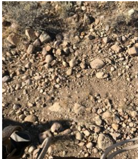
Nancy's Path Trail footing is rough in places