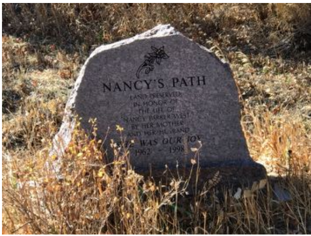
Nancy's Path Trail monument trailhead accessed from Hooks Road, in memory of Nancy Parker West