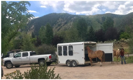
Glassier Equestrian Parking