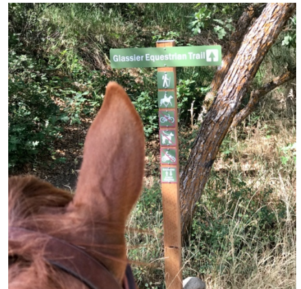
Trail Head - Ready to ride