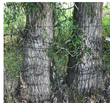
Old growth Cottonwood trees compromised by old ranch barb wire