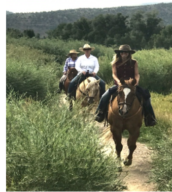
Trail on Glassier OST