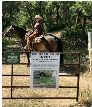
Your voice is important – Please thank Pitkin County OST & Commissioners.