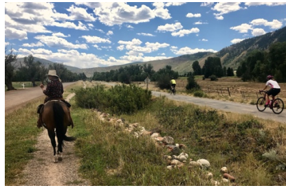
Soft track for horses & hikers next to Rio Grande Trail