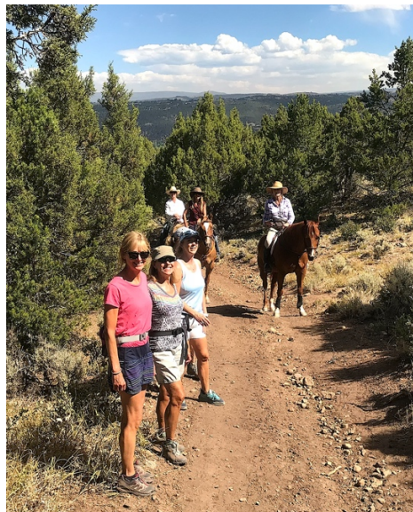
Sharing the trail with like minded Recreation Lovers.