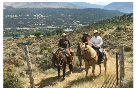
Entering BLM – Crown Jewel Horse Trail from Glassier Equersrtrian Trail