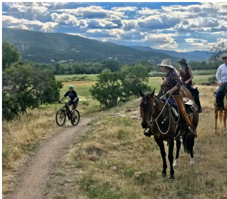
Multi use trail crossing Glassier OST to the Glassier Equestrian hiker horseback only trail