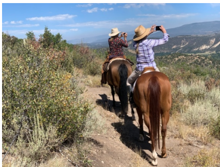
Excellent footing on the trail