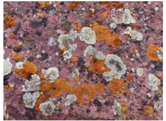
Lichen formed on red sandstone rocks along the trail