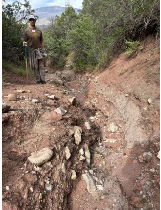
Trail condition in the Nancy's Path ravine, after recent storm, neighbor & volunteer, Will standing for scale of the damage.