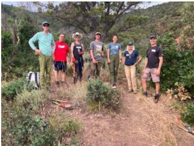
RFOV & RFVHC volunteer work crew