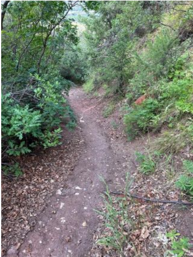
The bottom of Nancy's Path Trail condition before August 3 rd , the most recent storm