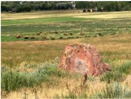
Highland beef cattle graze in the background