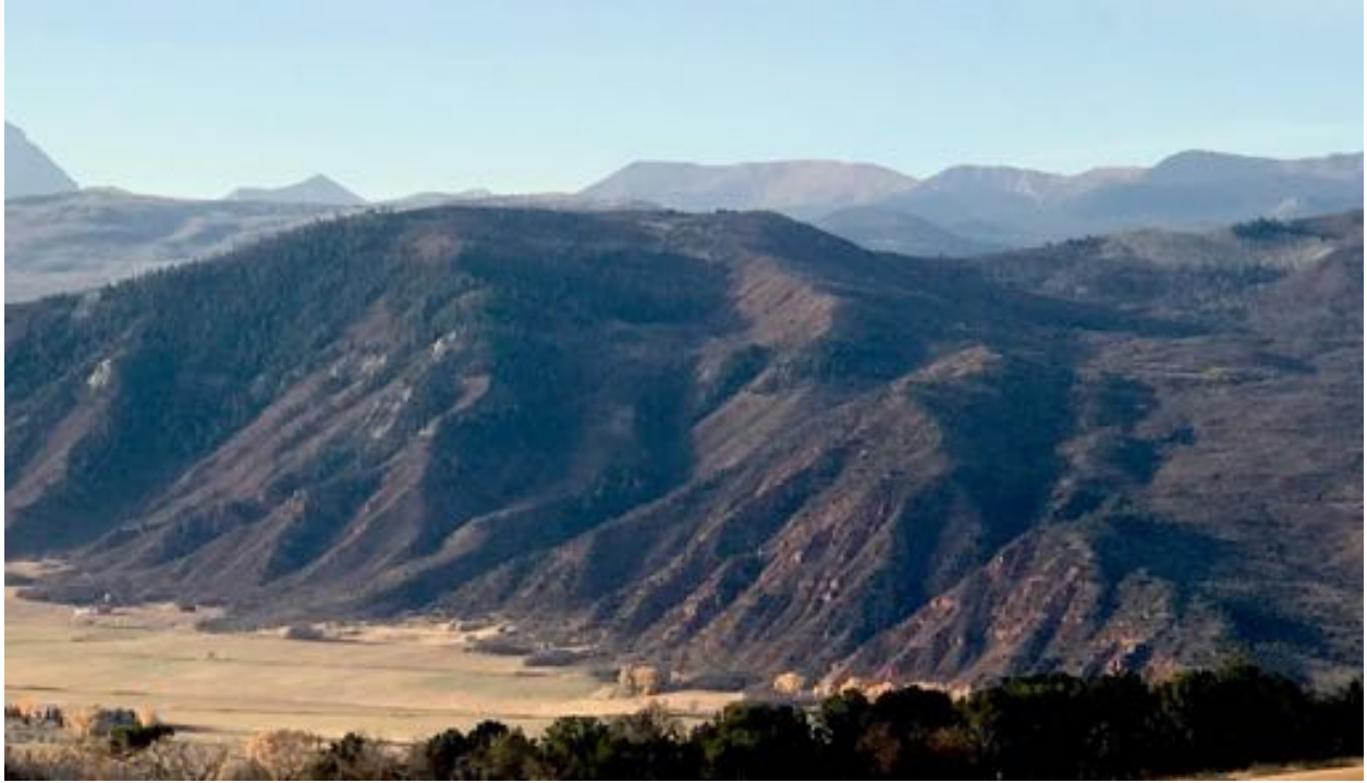
Nancy's Path ravine is evident in this photo.

The Community Family Trail makes sense, as more of our community can enjoy this verdant, non-challenging, peaceful experience. We hope that PCOST will consider implementing this Community Family Trail for the benefit of the equestrian and hiking public.