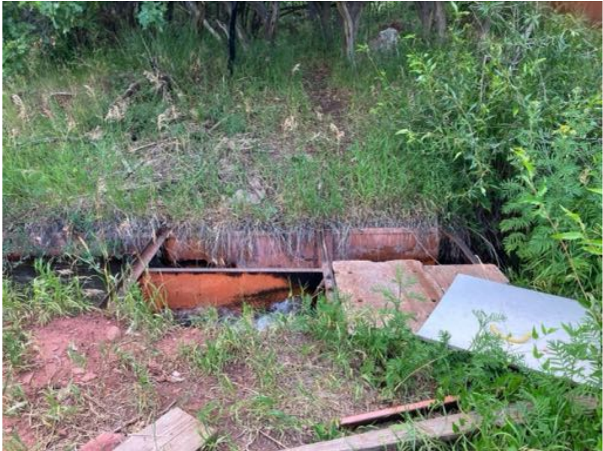
Existing splitter box for the "Home Supply Ditch" crossing area.

At the ditch crossing, there is a splitter box, sending some water onto the Glassier Open Space agricultural leased land and some water continues to other water shareholders' properties. Ted O'Brien of PCOST will orchestrate the potential culvert / bridge to accommodate this crossing for hikers and equestrians. This work can only be done after the irrigation water is turned off, either this fall of 2023 or next spring, 2024.