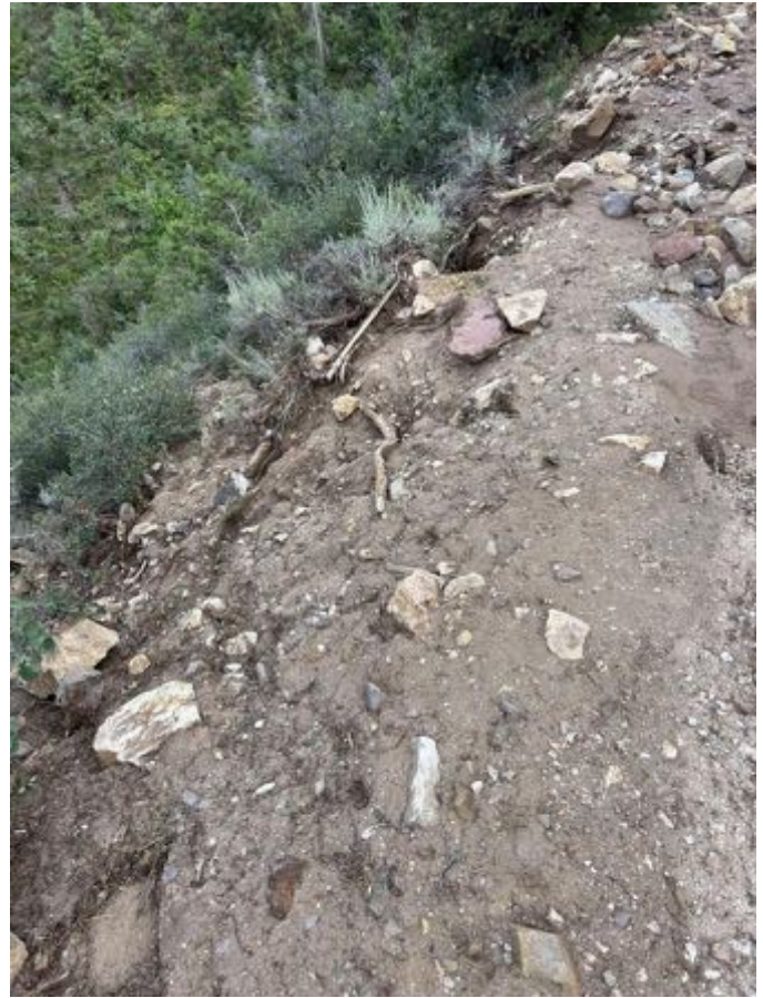
Trail is washed out. Rocks and gravel are pushed from the steep uphill side of the path on the right to this ledge littered with debris. If you look past the scattered sage brush on the left in this photo, there is a steep drop off. The trail is on this ledge. This is an example of the trail's general condition.