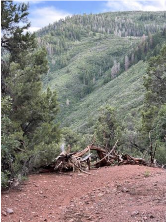
Makeshift guard rails at edge of cliff drop off