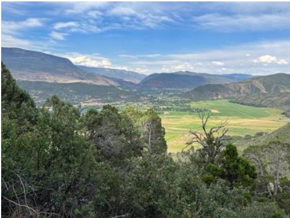
Incredible views looking toward Basalt from near the top of Nancy's Path