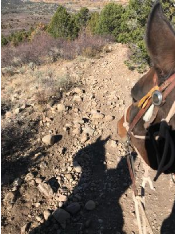
Loose large gravel & rocks make for slippery footing