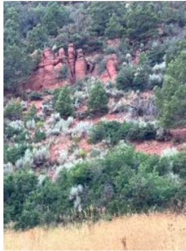
Red rock formation below the steep cliff above